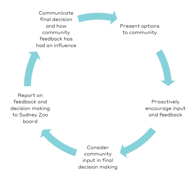
Figure 2. Sydney Zoo approach to engagement and community involvement in decision making.

on to Sydney Zoo's Management and Board and the outcomes of decisions, including how the community has influenced decisions will be communicated back to the community (Figure 2).