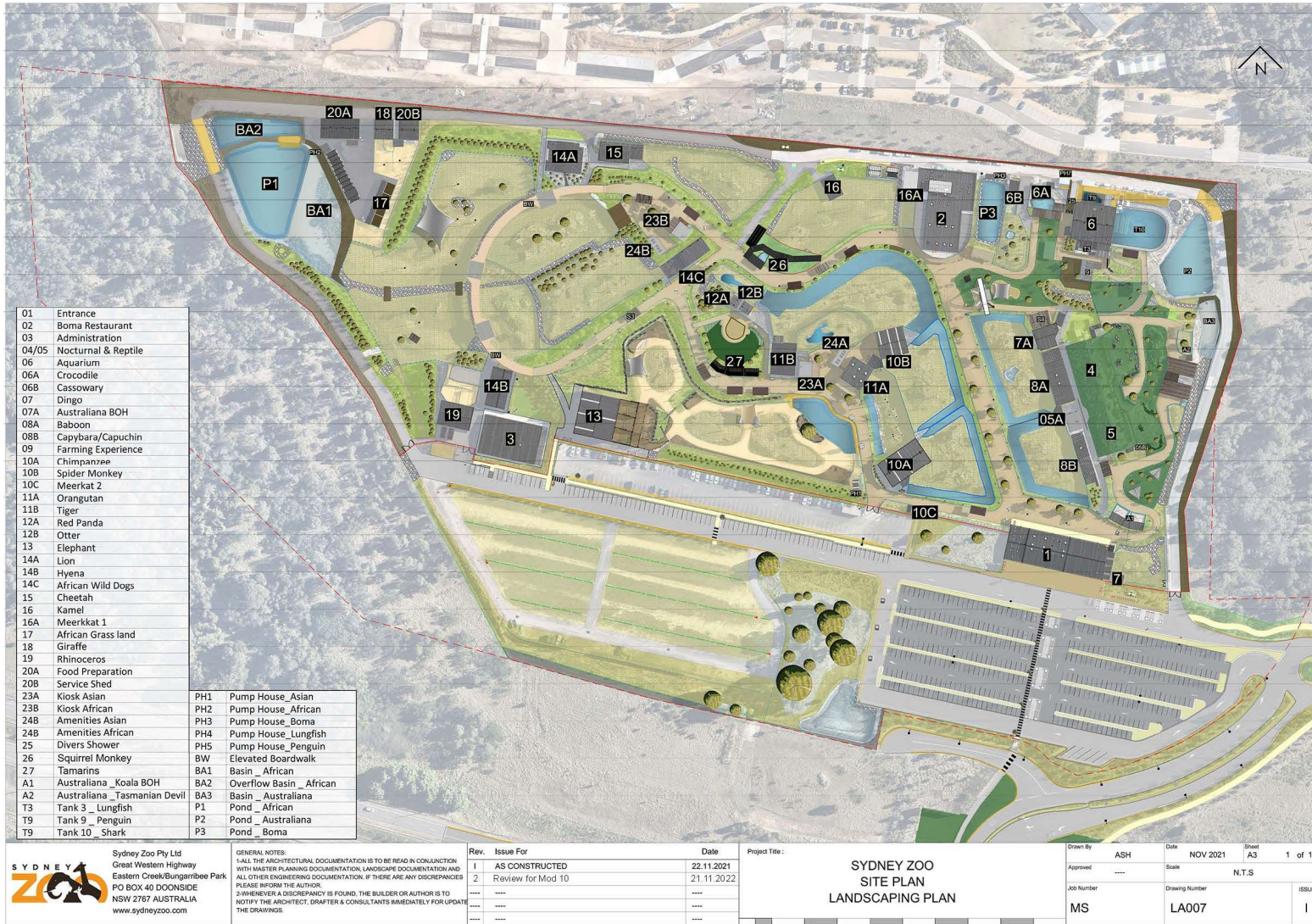
Figure 1 Approved Site Plan (Modification 10)